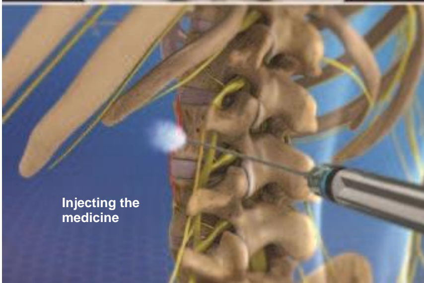
Injecting the medicine